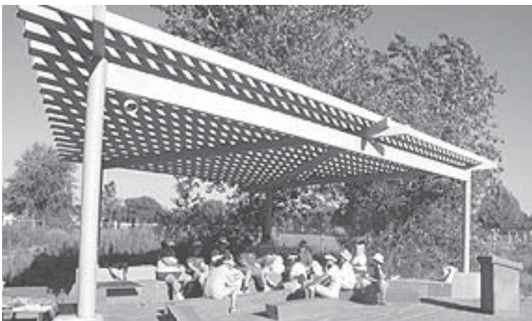
Outdoor classroom (above) and wetland plants (next page) at Los Padilla Wildlife Sanctuary.

and irrigate; they knew how to "read" their farm animals and care for them. The parents and grandparents knew how it used to be: the old ways of farming, healing and living and the cultural values inherent in the way of life of mas antes . All generations also knew that changes were occurring and some of these changes were beginning to cause