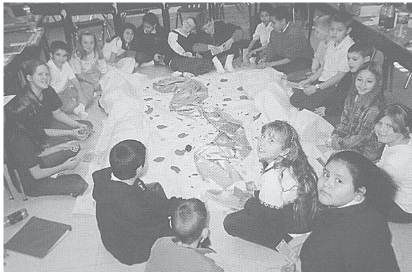
The river model as laid out by fourth-graders at Rio Rancho's Stapleton Elementary.