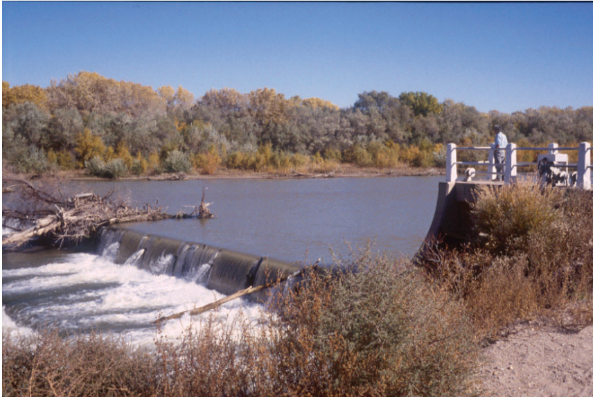
A diversion dam of the Middle Rio Grande Conservancy District near Algodones.