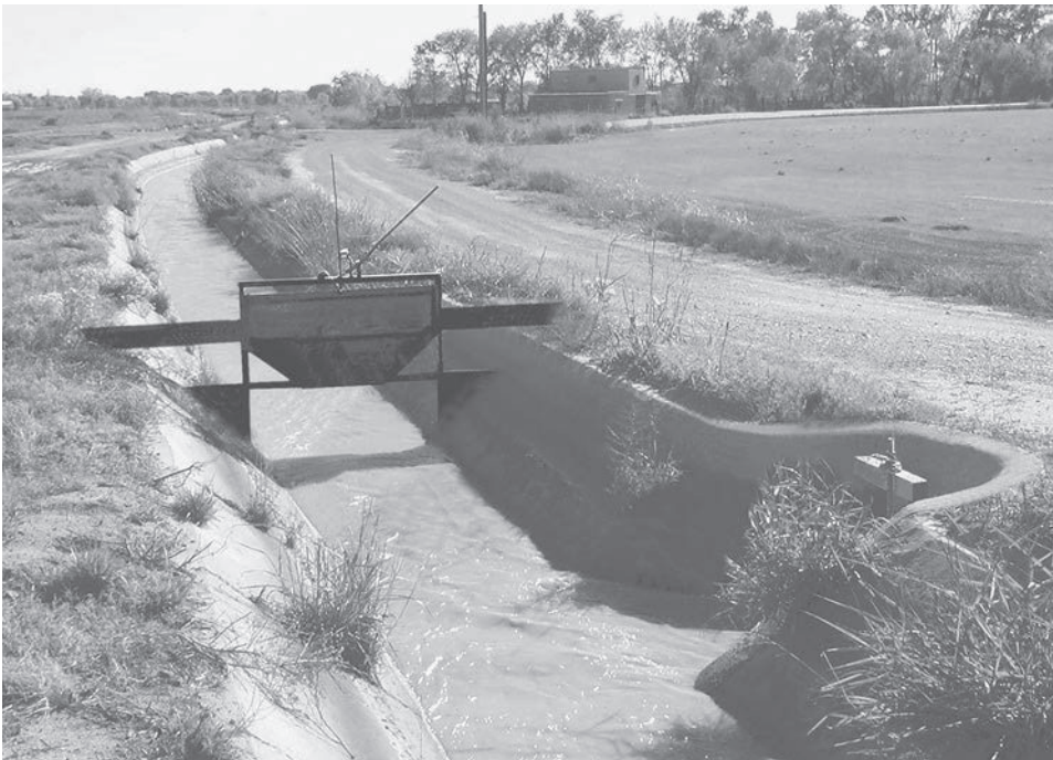
The metal structure on the left is a check. When it is closed the water in the high-line canal or lateral builds up to a level that will flow through the turnout, shown at lower right, into a farm field or smaller ditch.